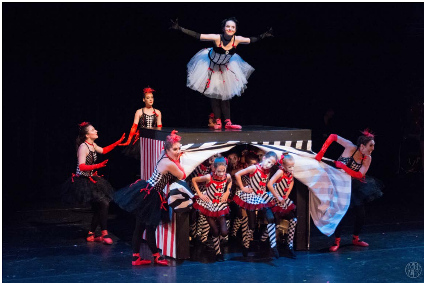
“The Night Circus”, June 2018