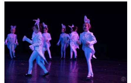
Tap & Ballet I

In this handbook you will find all you need to know about becoming a Dance Student, but we encourage all our dancers to visit the music department as well. We offer group and/or private music lessons for all instruments including voice. Whether you are a beginner or a member of your school band or orchestra, you will find a teacher who is passionate, qualified and enthusiastic about music and YOU!