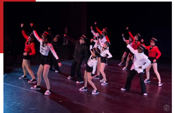
Hip Hop III/IV

A student may expect to spend 1-3 years in each level.