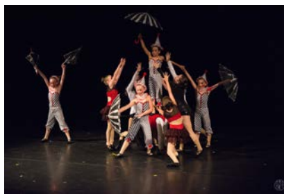
Ballet II, The Night Circus